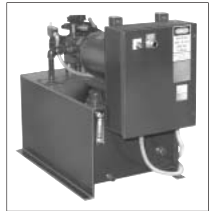
Remote Power Unit