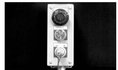
Remote Control (Shown with an optional advance full load indicator)