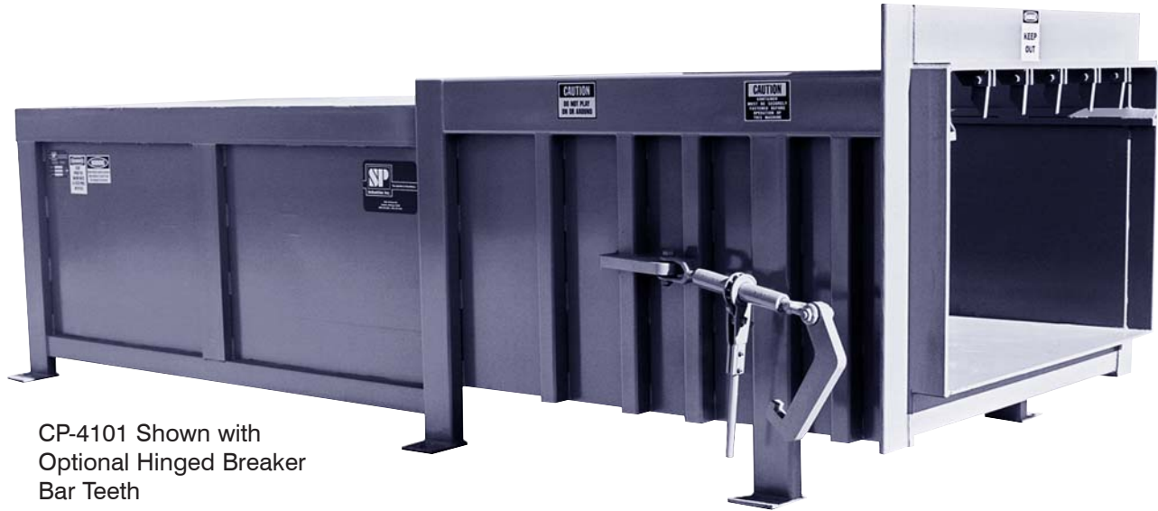
CP-4101 Shown with Optional Hinged Breaker Bar Teeth