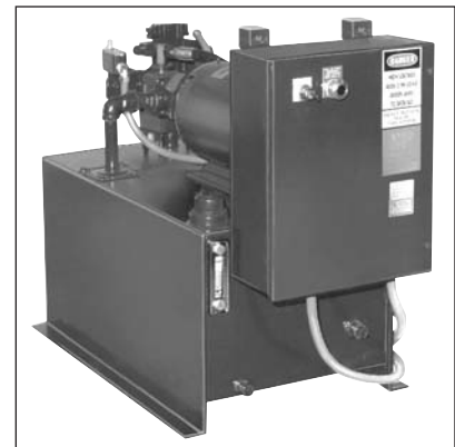
Standard 10 HP/16 GPM Power Unit for the CP-4101.

The Power Unit for the CP-4101-HD has a Similar Electrical Panel on a Larger Reservoir with a 20 HP Motor and a 30 GPM Pump.