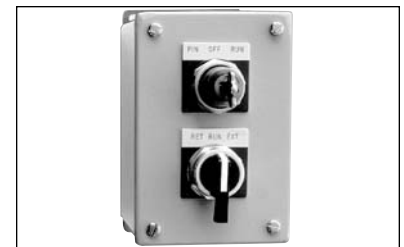
Pinning/Boost Override System Controls